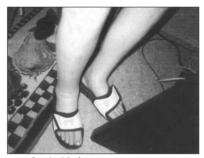
Fig.6 – Swelling in the right leg of LG (see case no. 3).