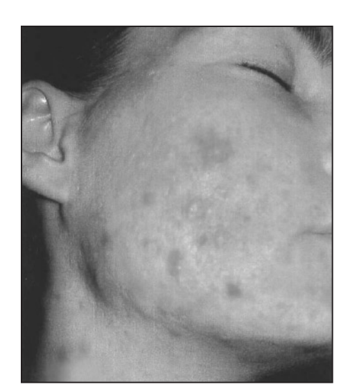
Fig. 1 – Inflamed sores in the face of EJ, a female from Norway born in 1971, treated 7 teeth with Dycal, Life, Clearfil SE Primer and Bond in 1979, and with Procosol (one root canal) in 1995; highly reactive to Dycal and Life (bio-compatibility test); first experienced NCS symptoms in 1989; diagnosed with NCS at PCI in April, 2004 followed our protocol, symptoms completely resolved by January, 2005.